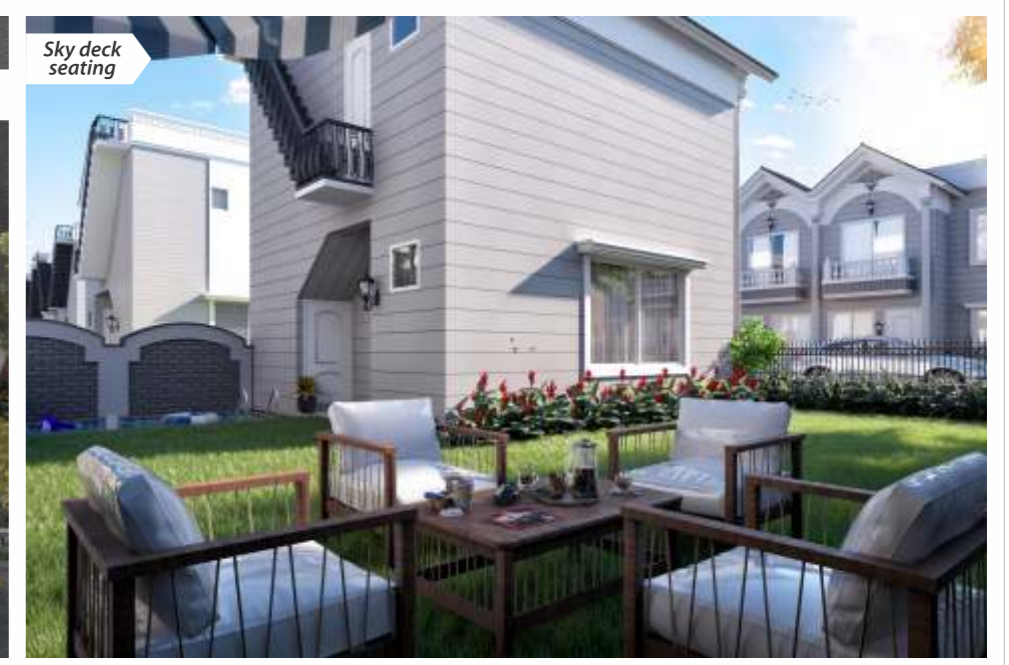
Sky deck seating