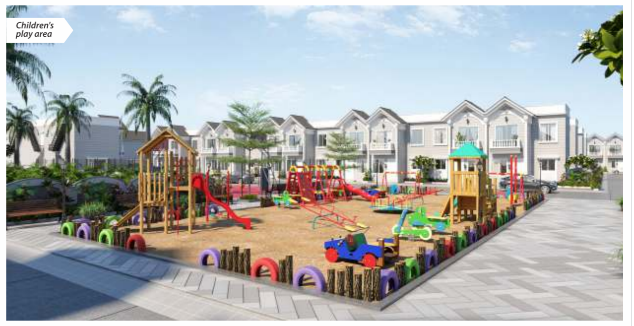
Children's play area